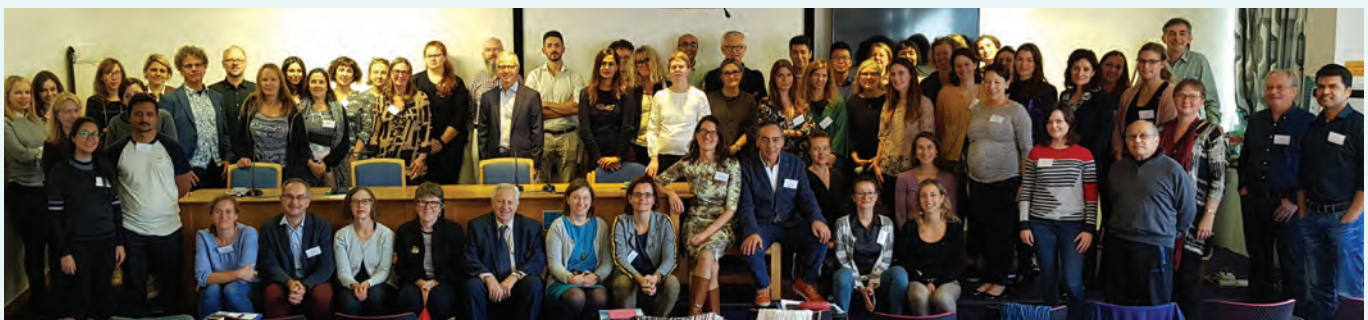
The 2018 ESPE Science Symposium