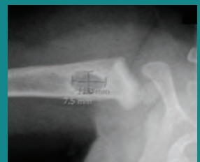
Humeral lesions in hypercalcaemia