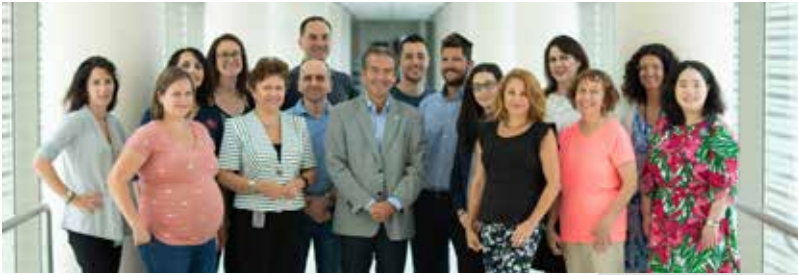
The authors with their colleagues