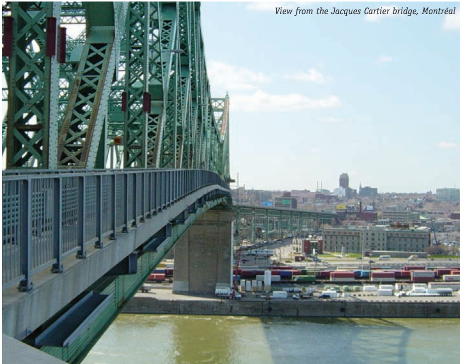
View from the Jacques Cartier bridge, Montréal