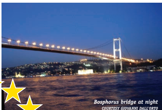
Bosphorus bridge at night

FEYZA DARENDELILER, ISTANBUL, TURKEY ESPE 2008 Local Organising Committee