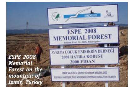
ESPE 2008 Memorial Forest on the mountain of Izmir, Turkey

ESPE is aware of the importance of safeguarding the environment and the 2008 meeting will be an environmentally friendly event. The amount of printed material has been decreased this year, meaning that more trees have been saved. This year's meeting is also important because it is the first time that the annual conference has been organized in a city that has a 'foothold' in both Europe and Asia. Therefore, to mark the occasion we have invited speakers from Asia, China and India, and for the first time will host a joint JSPE/ESPE lecture. Furthermore, in celebration of ESPE's European origins, an 'ESPE 2008 Memorial Forest' with 3000 trees has