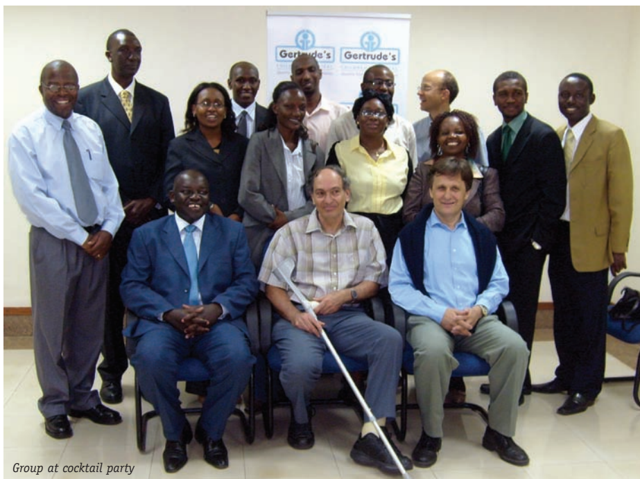
Group at cocktail party