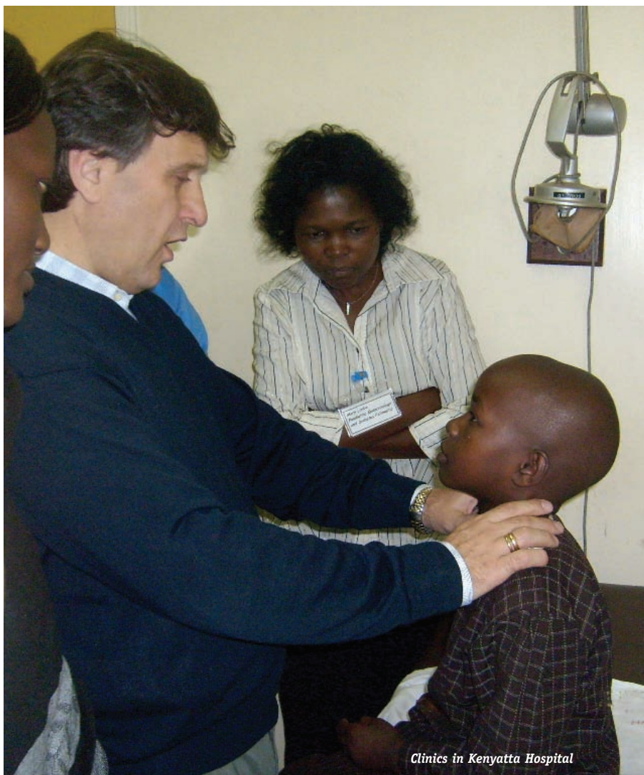
Clinics in Kenyatta Hospital

The first month of our interesting experience will be finished soon, but we are sure that the forthcoming months will be even more interesting